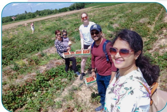
Strawberry Picking in June