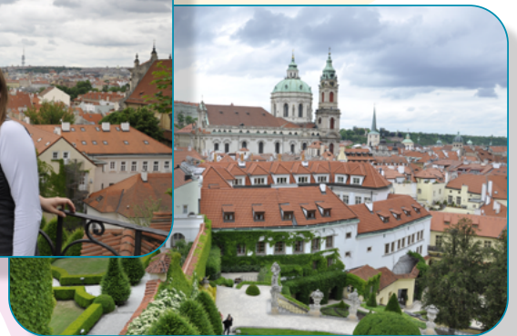
Guided Tour of Prague Gardens in May